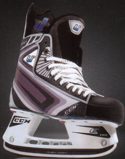
SR: SKUPRO JR & YT: SKPLUS